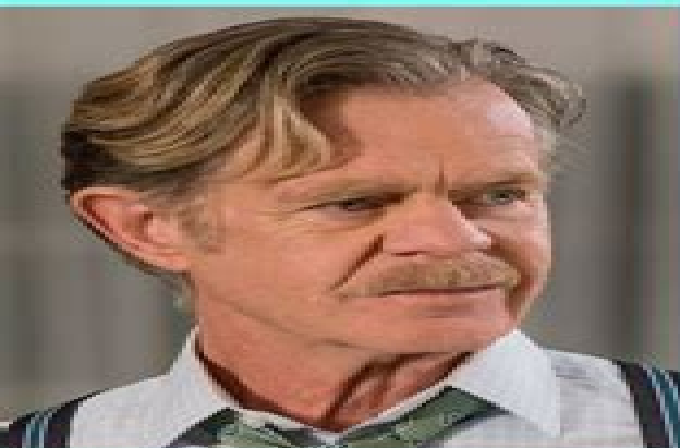
WILLIAM H. MACY