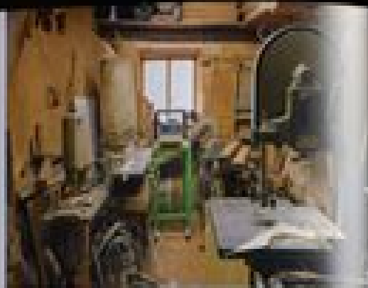
The making room.