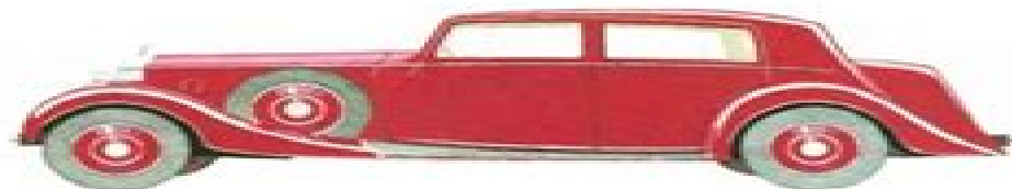
40/50 H.P. ROLLS-ROYCE

H. J. MULLIN & CO. LTD CHICHESTER, HANTS.