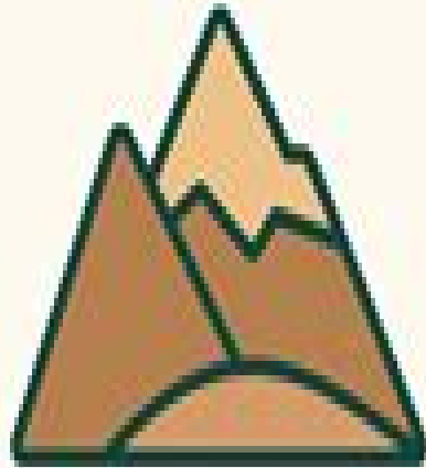
Topography and Geology