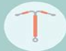
Copper intrauterine device (IUD)