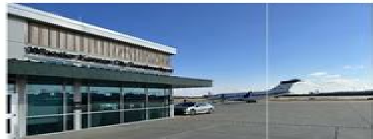
Airport Terminal Entrance