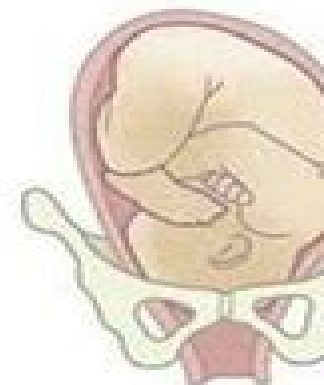
LOT Left occipitotran