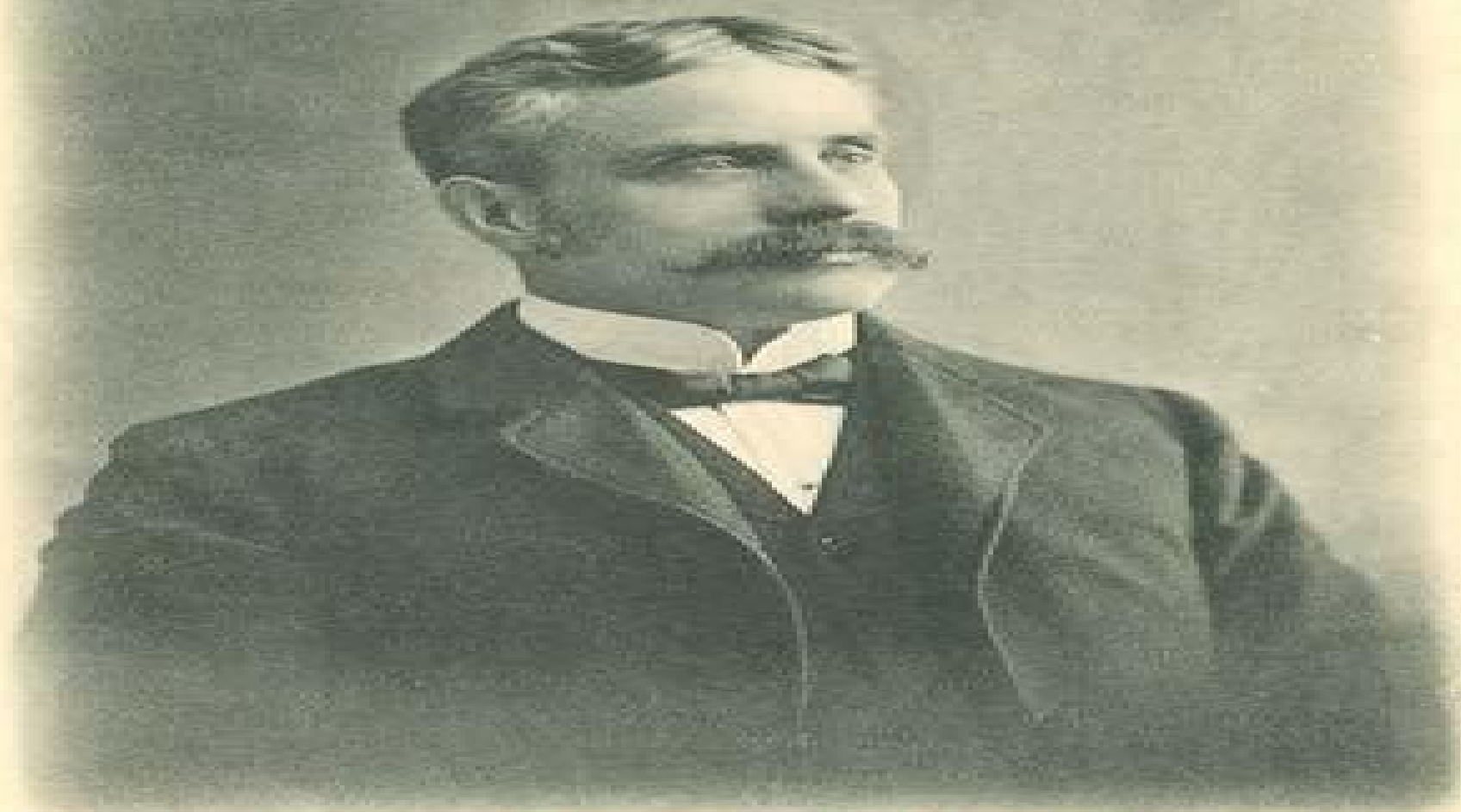
Mr. R. E. Borden, M. P.

Imperial Series No. 1002. Picture Post Card Co., Ottawa.