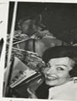
A pretty smile and beverage menu at gala party.