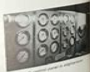
Engine room control panel in ship.