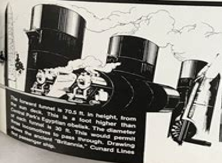
The forward funnel is 70.5 ft. in height, from the gun deck. This is a foot higher than Queen Mary's Egyptian obelisk. The diameter of each funnel is 30 ft. This would permit four locomotives to pass through. Drawing shows the smallest "Britannia," Cunard Lines' big passenger ship.