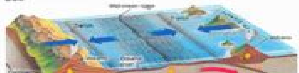
Figure 2 How did the volcanoes in the Andes Mountains form?

Volcanoes also occur where an oceanic plate is subducted beneath a continental plate. Collisions of this type produced the volcanoes of the Andes Mountains in South America and the volcanoes of the Pacific Northwest in the United States.