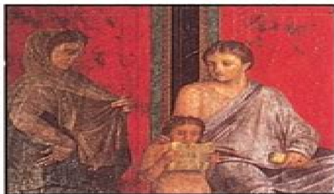
Pompeian citizens contemplating a red-hot future.

"Besides," he told the Record , "such talk of impending disaster is all poppycock. I've spent considerable sums of money