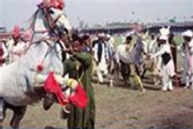
The Dancing Horses - Regional Festival