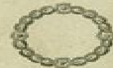
Chaplet or Garland