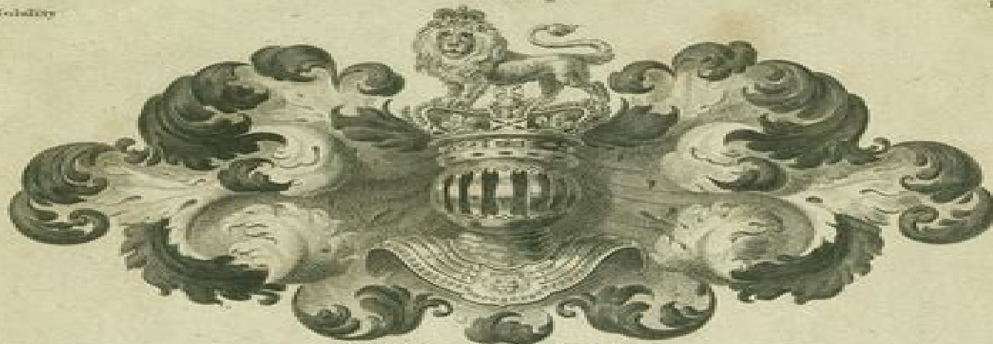
Herbert Crest and Mantling or Landerings of the