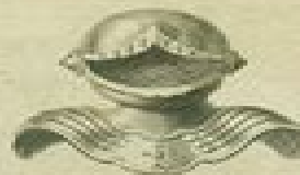
Baronet & Knight