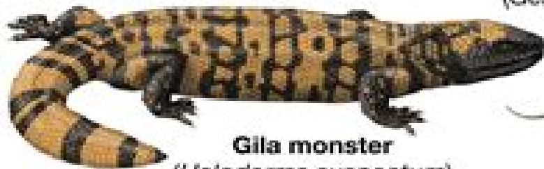
Gila monster ( Heloderma suspectum )