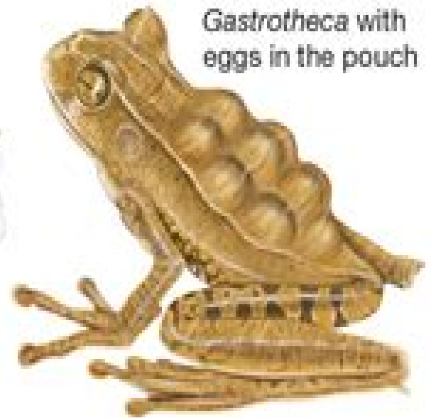
Gastrotheca with eggs in the pouch