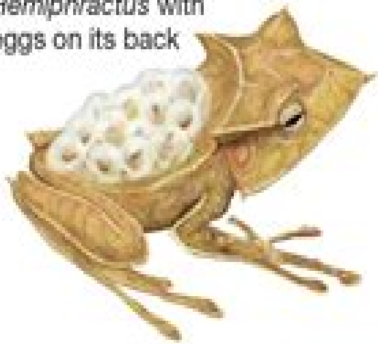
Hemiphractus with eggs on its back