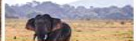
Sri Lankan Elephant