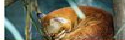
Asian Golden Cat