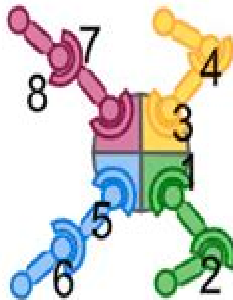
(d) 4-Agent Ant [4x2]