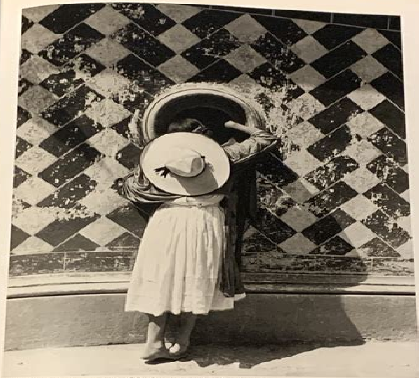
La hija de los bailarines (Daughter of the dancers), Cholula, Puebla, 1933