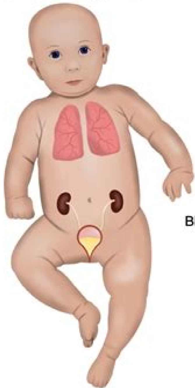
Lower Urinary Tract Obstruction