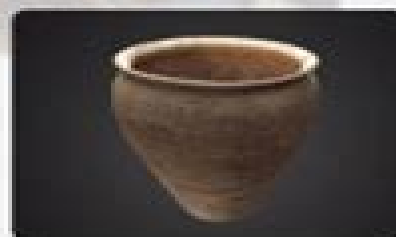
Olla de cerámica