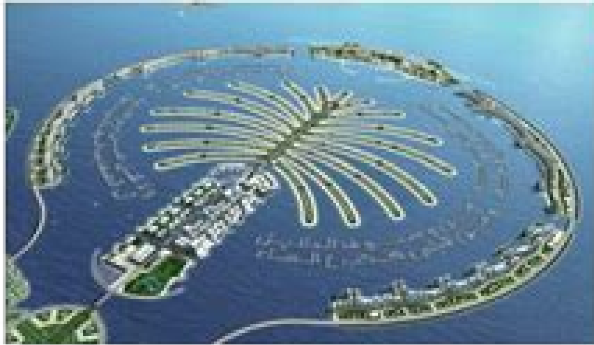
Palm Islands are artificial islands in Dubai

Land reclamation is the process of restoring land that has been mined or converting bodies of water to land.