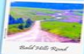
Bald Hills Road