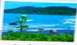
Yard Loop Trail

Clacka Trail ● Easy, level trail surface. Distance & Description: 1.5 miles, 20 minutes. Location: Signed access road to Redwood Forest on east side of Highway 101, south of "Highway 101/102" junction. Turn right on Highway 101, south of Highway 102, and follow the trail to the right. The trail is a loop that circles the Redwood Forest and returns to the parking area. The trail is a loop that circles the Redwood Forest and returns to the parking area. The trail is a loop that circles the Redwood Forest and returns to the parking area.