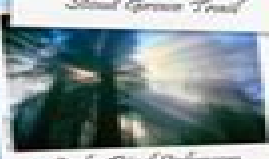
Lady Bird Johnson Grove Trail

Lady Bird Johnson Grove Trail ● Easy, level trail surface. Distance & Description: 1.5 miles, 20 minutes. Location: Signed access road to Redwood Forest on east side of Highway 101, south of "Highway 101/102" junction. Turn right on Highway 101, south of Highway 102, and follow the trail to the right. The trail is a loop that circles the Redwood Forest and returns to the parking area. The trail is a loop that circles the Redwood Forest and returns to the parking area. The trail is a loop that circles the Redwood Forest and returns to the parking area.