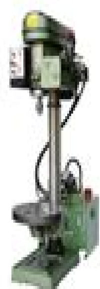
Drill press machine