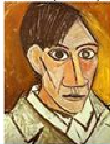
Self-Portrait 1907 By Picasso