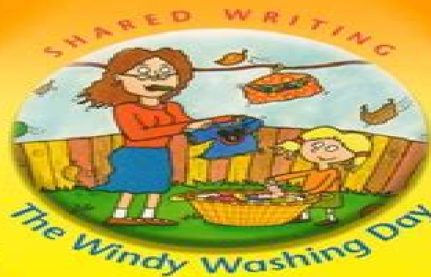
The Windy Washing Day