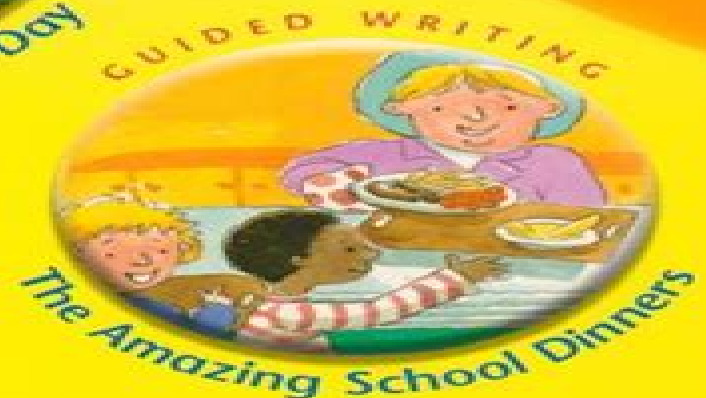
The Amazing School Dinners