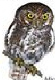
ELF OWL Micronathus velox