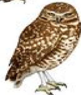
BURROWING OWL Athene cunicularia