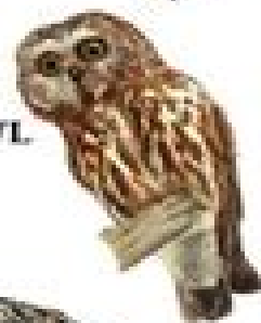
NORTHERN SAW WHET OWL Accipiter americanus