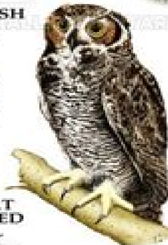
GREAT HORNED OWL Bubo virginianus