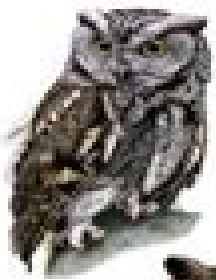
WESTERN SCREECH OWL Megascops asio