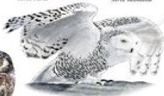
SNOWY OWL Nyctaleus nyctaleus