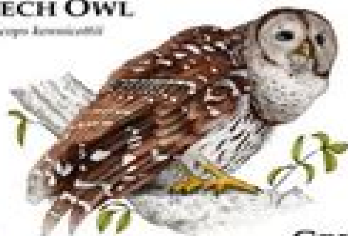
GREAT GRAY OWL Strix nebulosa