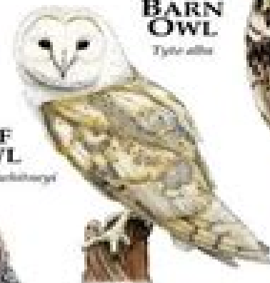
BARN OWL Tyto alba