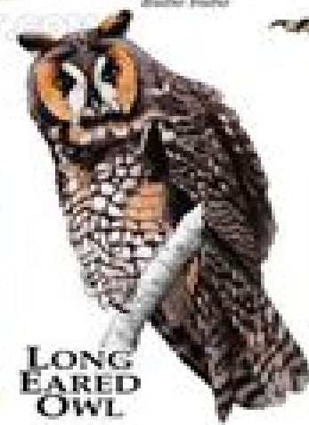
LONG EARED OWL Asio otus