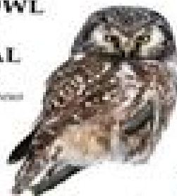
BOREAL OWL Asio flammeus