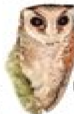
Oriental Bay Owl