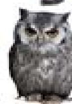
Southern White-Faced Owl