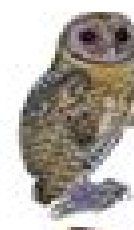
Golden Masked Owl