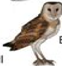
Eastern Grass Owl