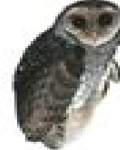
Lesser Sooty Owl