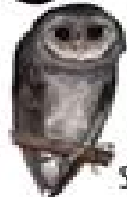
Greater Sooty Owl