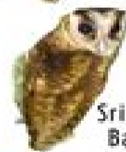
Sri Lanka Bay Owl