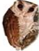
Congo Bay Owl