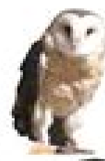
African Grass Owl