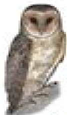
Australian Masked Owl