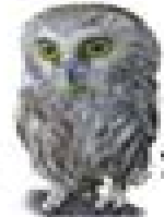
Northern Saw-Whet Owl