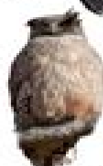
Blakiston's Fish Owl