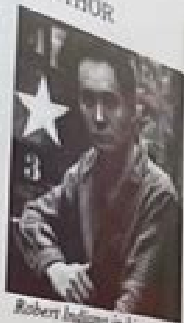
Robert Indiana in his studio

Robert Indiana was known as a poet at The University of Edinburgh, and as an artist at the Chicago Art Insti- tute in the 1960s. Indi- ana has received interna- tional recognition from ev- ery artistic circle, includ- ing those of fellow Pop ar- tists like Andy Warhol who made a feature film about him titled EAT. His work has become a classic of contemporary ground cinema.