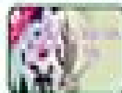
Year 4 Maths Meetings: Problem Solving

Maths Meetings are a great way to provide a short but effective session of learning, including a variety of topics, including problem-solving, reasoning, and problem-solving, and to make sure that you are getting the most out of your time. They are a great way to make the most of your time and to make sure that you are getting the most out of your time.