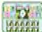
Year 4 Maths Meetings: Addition and Subtraction