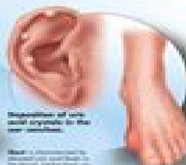
Degeneration of the ear canal crystals in the ear infection.

Gonorrhea is a bacterial infection that can affect the joints. It is characterized by joint pain and swelling. The inflammation is caused by the bacteria entering the joint space through the bloodstream. The disease is more common in men than in women and typically begins between the ages of 20 and 30. It is a systemic disease, meaning it can affect other parts of the body besides the joints.