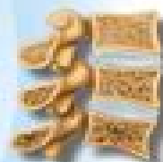
Stenosis with osteoarthritis. The greater of loss of mobility from the hip to the knee is illustrated.

Rheumatic diseases can have long-term consequences that affect the joints and other parts of the body. These consequences include joint deformities, chronic pain, and disability. The disease is more common in older people and typically begins between the ages of 40 and 50. It is a systemic disease, meaning it can affect other parts of the body besides the joints.