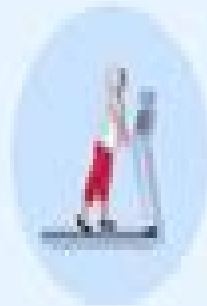
Early Intervention Matters