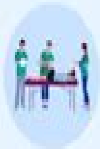
Holistic Care Focus