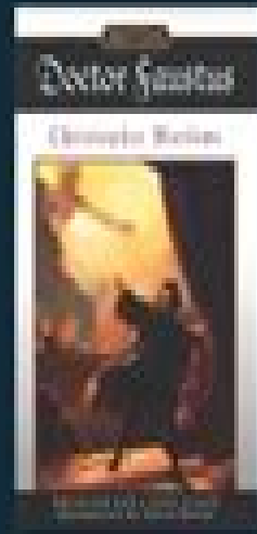
Doctor Faustus , Christopher Marlowe