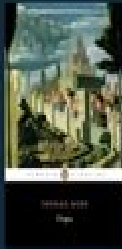
Utopia , Thomas Moore