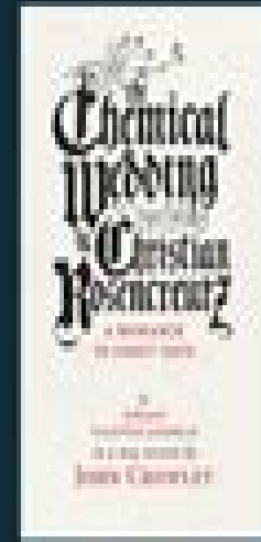
The Chemical Wedding , Johann Valentin Andreae