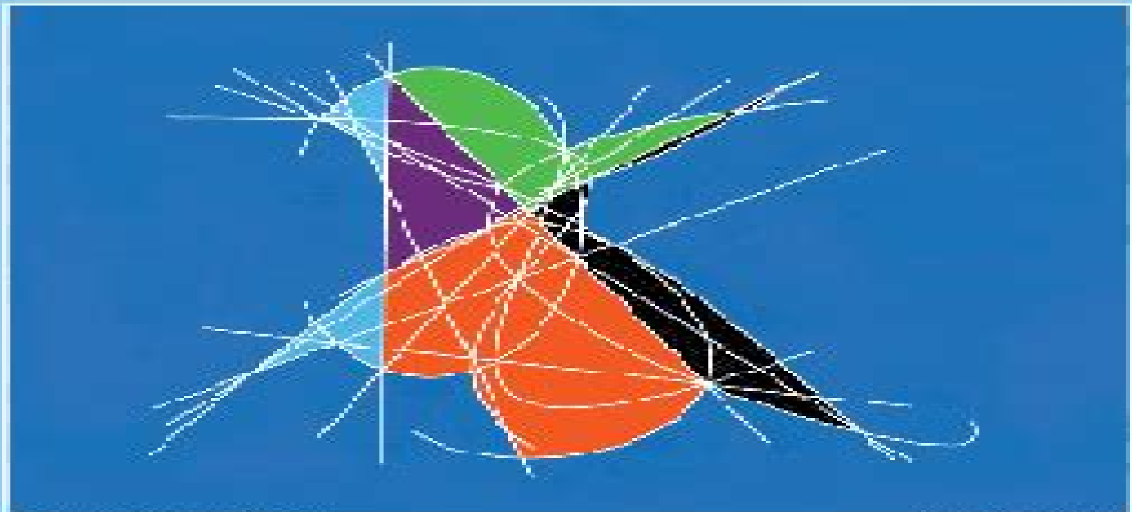
"CUT SPACE SERIES # 34"

CONTEMPORARY PRINTS AND PRICES SIXTEENTH EDITION 2017