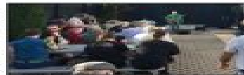
The 11th annual Catoberfest will be held in Beacon on September 17. Pictured is from a previous year's event.