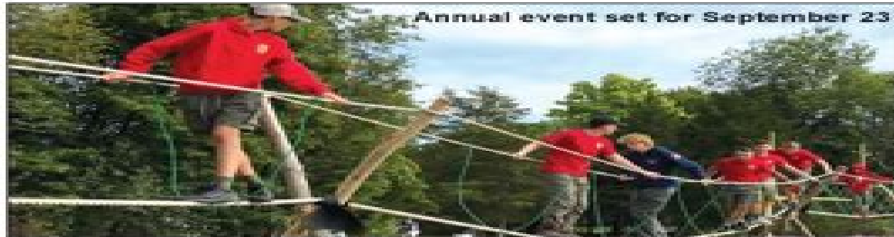
Annual event set for September 23

Scout Troop 48 will have its rope bridge ready for attendees to try at the annual East Fishkill Community Day on Sept. 23 at the Recreation Grounds on Route 578.