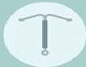
Hormonal intrauterine device (IUD)