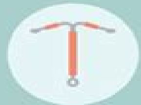
Copper intrauterine device (IUD)