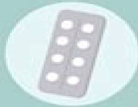
Combined oral contraceptive pill