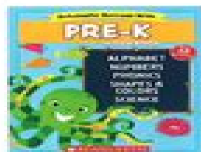
Scholastic Success With Pre-K 978-1-338-75857-3

Look for these other Scholastic Success With titles: