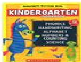
Scholastic Success With Kindergarten 978-1-338-75858-0