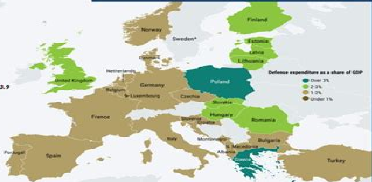
NATO Defense Spending 2023 (estimated) 1.3 Trillion USD