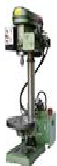
Drill press machine