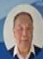
Yuncheng You United States