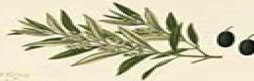
Blackberry Rubus fruticosus