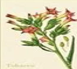
Blackberry Rubus fruticosus