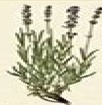
Blackberry Rubus fruticosus