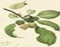
Blackberry Rubus fruticosus