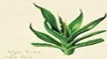
Olive Olea europaea