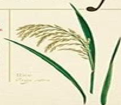
Poppy Papaver rhoeas