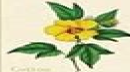
Yellow Scilla maritima