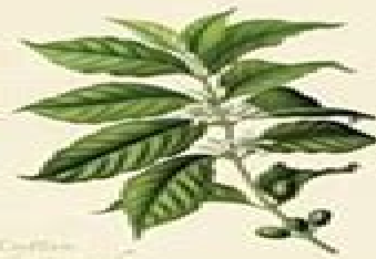
Coffee Coffea arabica