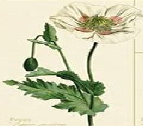
Poppy Papaver rhoeas