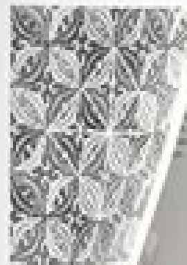
© 2004 Blackwell Publishing Ltd, Journal of Internal Medicine 255: 399–404