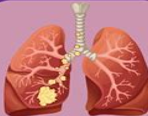
3 STAGE - Tumor more than 6 cm. Metastases in the lymph nodes.