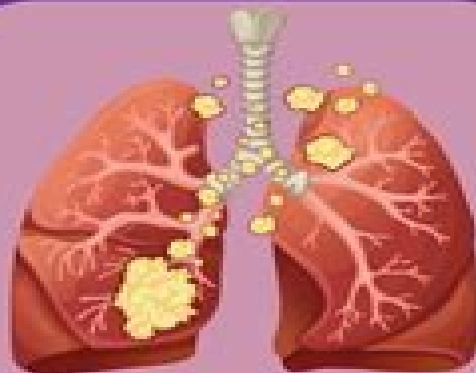
4 STAGE - The tumor passed to other organs