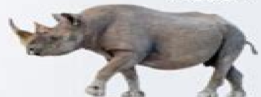
West African Black Rhinoceros