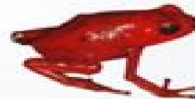
Splendid Poison Frog