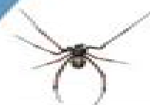
Northern Black Widow