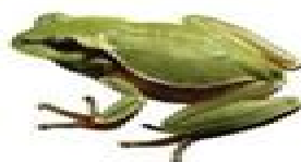
Pine Barrens Treefrog