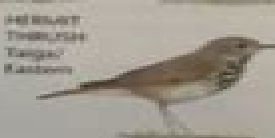
HERMIT THRUSH Tanager Eastern