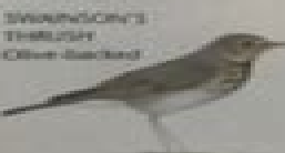
SWAINSON'S THRUSH Olive-backed