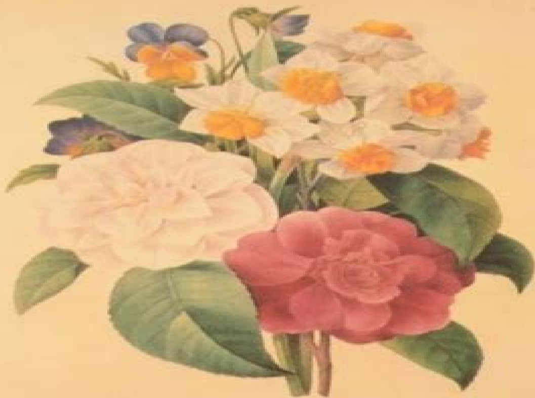
Stem of a flower - a branch of a flower