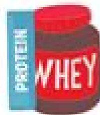
Protein Bars + Powder