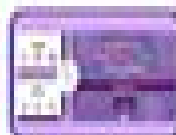
Year 4 Maths Meeting: Statistics and Probability

These are the 100 most common words in the English language. They are also the 100 most common words in the English language. They are also the 100 most common words in the English language.