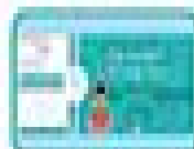
Year 4 Maths Meeting: Fractions and Decimals

These are the 100 most common words in the English language. They are also the 100 most common words in the English language. They are also the 100 most common words in the English language.