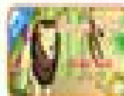
Year 4 Maths Meeting: Reasoning