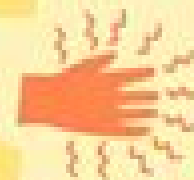
Numbness and tingling