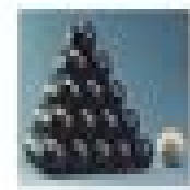
250 MWt Pebble Bed